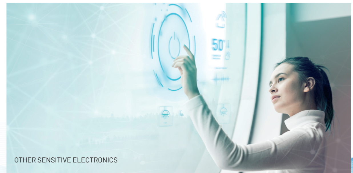
OTHER SENSITIVE ELECTRONICS

*Specifications are subject to change without notice.